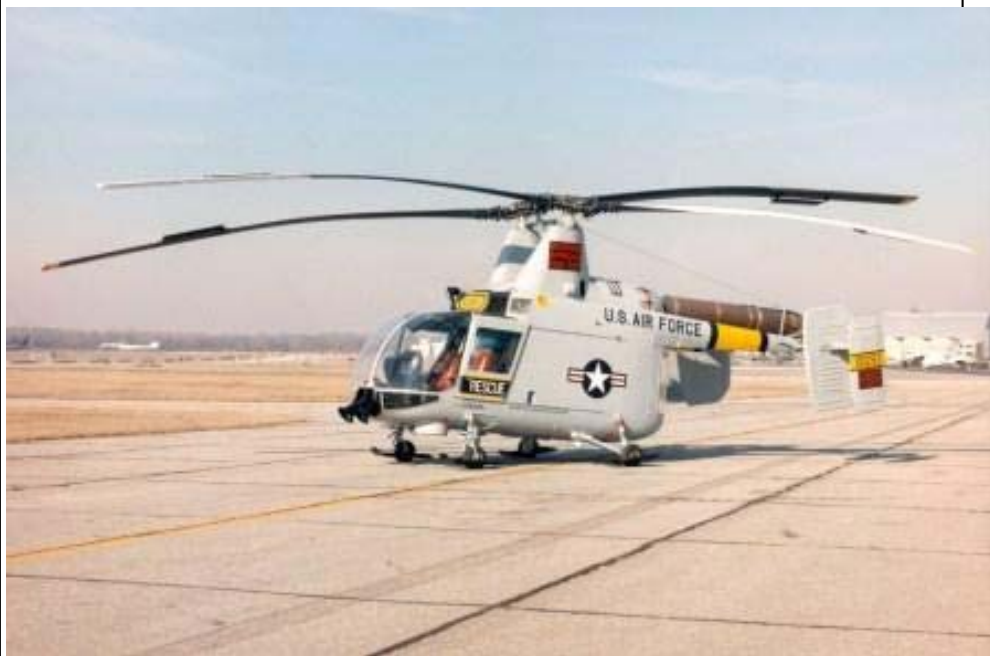
HH-43 Husky