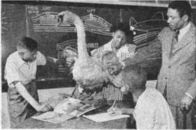
Aerodynamics of a swan is studied by biology students in junior high school so they can better understand basic reasons why an airplane flies. On blackboard, they diagrammed principles of aerodynamics—a word they love to use eruditely—and mounted pictures of planes.

weather bureau. A more formalized Air Age curriculum is followed by high-school students. Tennessee currently has 371 of them flying.