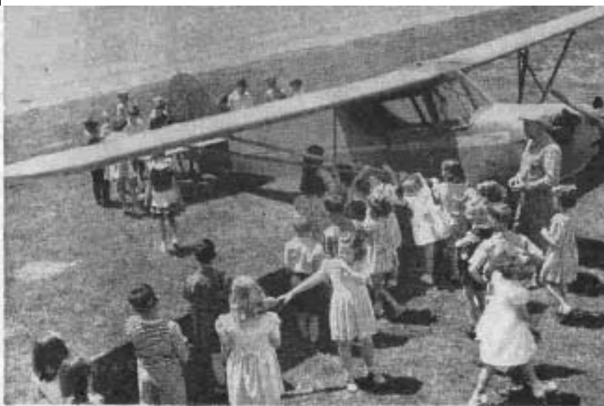
Inspecting a real plane for the first time is a climax to 7-year-olds' airport visit. They examine the trainer to identify all the parts that they have studied on a model plane in their classroom and boldly push the stick and rudder pedals to show what happens on wings and tail.