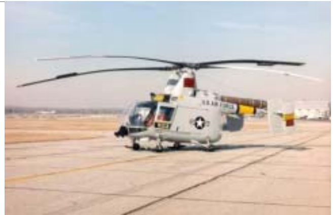
HH-43 Husky

Email president@eaa17.org with your suggestions.